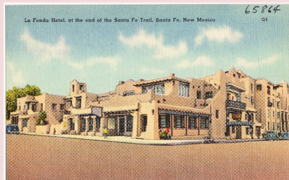
La Fonda on the Plaza